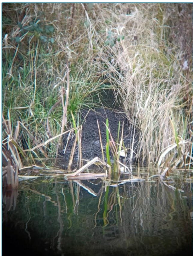
Figure 3: Otter holt along the southern bank of the Royal Canal (January 2023)