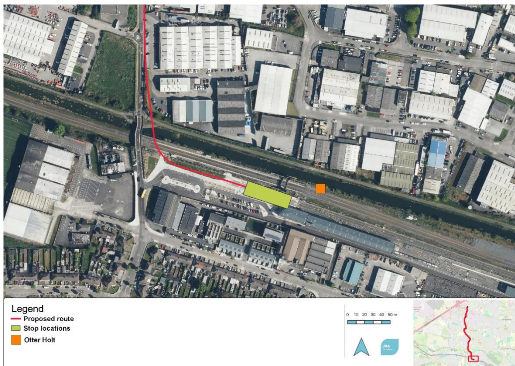
Figure 2: Location of recorded Otter holt in respect to the proposed scheme at Broombridge